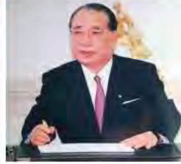
ডঃ দাইসাকু ইকেদা

গাক্কাই। বর্তমানে সদস্য সংখ্যা দুই লক্ষাধিক, যার মধ্যে একলক্ষ সদস্য এই প্রজন্মের যুব সম্প্রদায়, যারা স্বপ্ন দেখাচ্ছেন মানবতা আর শিক্ষার আদর্শে এক ভেদাভেদহীন ভবিষ্যৎ ভারতীয় সমাজ গড়ে তোলার। দাইসাকু ইকেদা তাঁদের জীবন শিক্ষক।