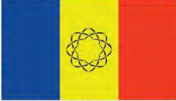
সোকা গাক্কাই'র আন্তর্জাতিক পতাকা।

প্রত্যেকটি প্রাণের আছে এই পৃথিবীতে বাঁচার অধিকার। আমরা সবাই আসলে সমান। বিশ্বের ১৯২ টি দেশে ১২ মিলিয়নেরও বেশি সাধারণ মানুষকে শান্তির পথে সুন্দরভাবে বাঁচতে উদ্বুদ্ধ করছে সোকা গাক্কাই ইন্টারন্যাশনাল। এই